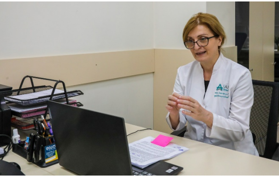
UN agencies delivered essential hygiene and medical supplies, technical and in-kind support, psycho-social counselling, hospital readiness and laboratories.