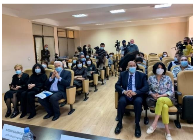
Meeting with media representatives of Akhaltsikhe hosted by NCDC and healthcare experts to discuss COVID-19 vaccination in Georgia