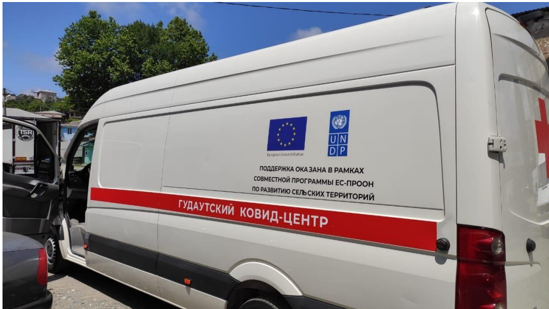
A vehicle for transporting oxygen tanks delivered by UNDP to the Gudauta COVID-19 hospital.